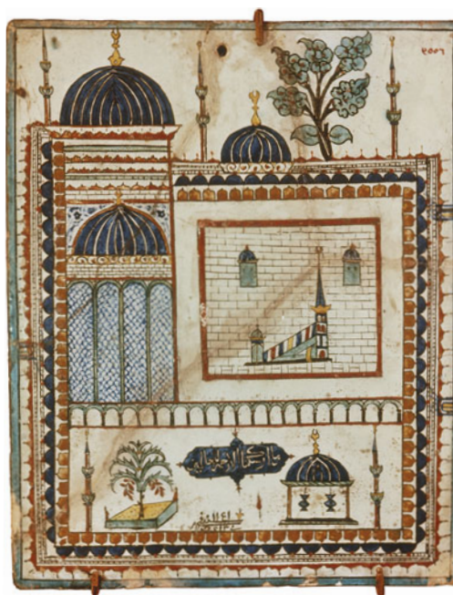
A schematic view of Medina, second holiest city in Islam, ceramic tile from the Mamlūk period, 16th century; in the Museum of Islamic Arts, Cairo

Sacred places and days. The most sacred place for Muslims is the Sacred Mosque at Mecca, which contains the Ka'ba, the object of the annual pilgrimage and the site toward which Muslims direct their daily prayers. It is much more than a mosque; it is believed to be "God's Sacred House," where heavenly bliss and power touch the earth directly. The Prophet's mosque in Medina, where Muhammad and the first CALIPHS are buried, is the next in sanctity. Jerusalem follows in third place as the first QIBLA ( i.e. , direction in which the Muslims faced to offer prayers, before the qibla was changed to the Ka'ba) and as the place from where