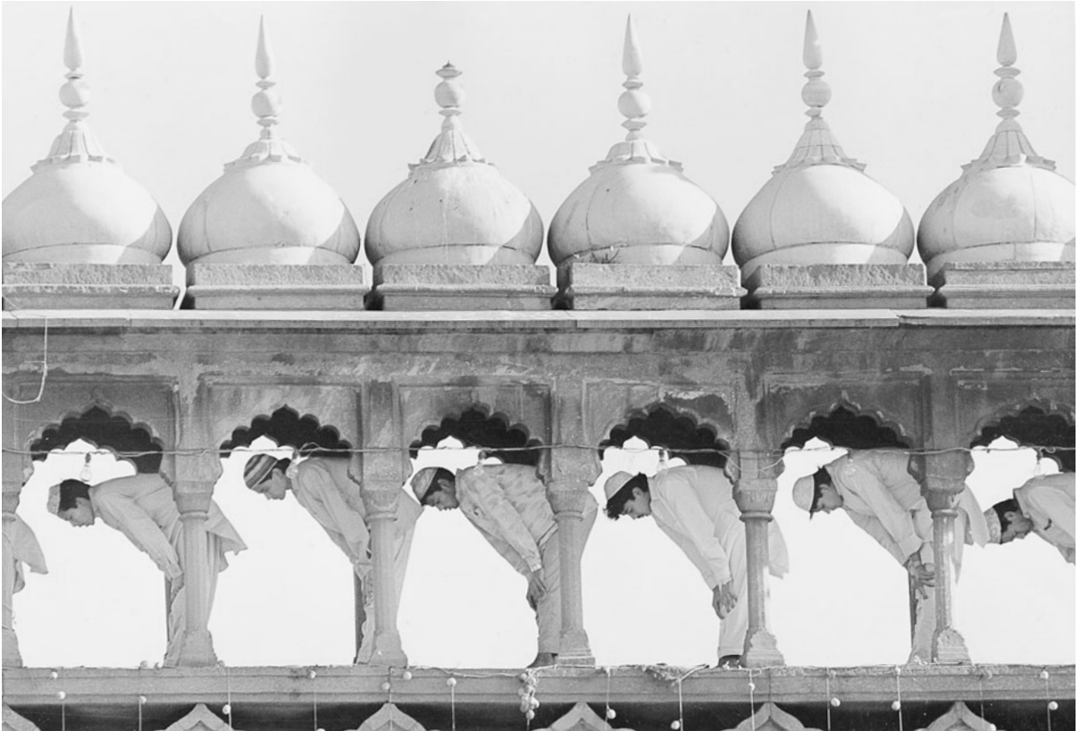
Muslim men in the upper gallery of the main mosque in Delhi, India, at prayer for the holiday of 'Īd al-Fiṭr