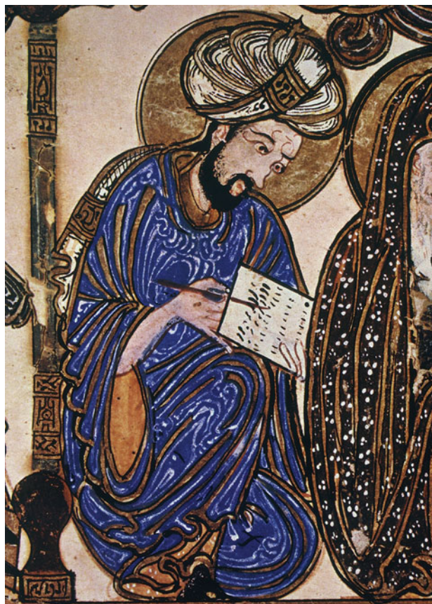
The Scribe, detail of a miniature in an Arabic manuscript, 13th century, Baghdad

The account of the doctrines of IBN AL-'ARABĪ (12th–13th century) belongs properly to the history of Islamic mysticism. Yet al-'Arabī's impact on the subsequent development of the new wisdom was in many ways far greater than that of al-Suhrawardī. This is true especially of his central doctrine of the "unity of being" and his distinction between the absolute One, which is undefinable truth ( haqq ), and his self-manifestation ( zuhūr ), or creation ( khalq ), which is ever new ( jadīd ) and in perpetual movement, a movement that unites the whole of creation in constant renewal. At the very core of this dynamic edifice stands nature, the "dark cloud" ( 'amā ) or "mist" ( bukhār ), as the ultimate principle of things and forms: intelligence, heavenly bodies, and elements and their mixtures that culminate in the perfect man. This primordial nature is the "breath" of the merciful God in his aspect as Lord. It flows throughout the universe and manifests truth in all its parts. It is the first mother through which truth manifests itself to itself and generates the universe. And it is the universal natural body that gives birth to