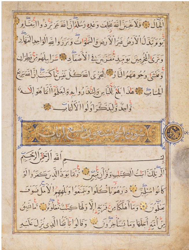
A page from the Qur'an, on paper, Arabia, 16th century

Despite this lofty station, however, human nature is frail and faltering. Whereas everything in the universe has a limited nature, and every creature recognizes its limitation and insufficiency, humans are viewed as rebellious and full of pride, arrogating to themselves the attributes of self-sufficiency. Pride is thus viewed as the cardinal sin of humankind, because by not recognizing in itself essential creaturely limitations humankind becomes guilty of ascribing to itself partnership